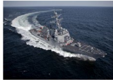
MARINE SYSTEMS BATH IRON WORKS ELECTRIC BOAT NASSCO