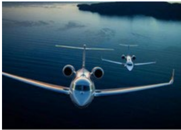
AEROSPACE GULFSTREAM JET AVIATION