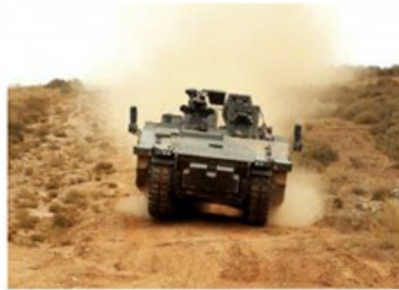
COMBAT SYSTEMS EUROPEAN LAND SYSTEMS LAND SYSTEMS ORDNANCE AND TACTICAL SYSTEMS